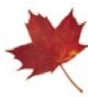
Canadian owner tries to re-open distillery